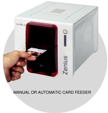
MANUAL OR AUTOMATIC CARD FEEDER

Easy handling, automatic ribbon recognition and setup